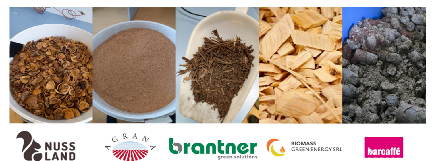
Fig. 3: Residues selected for pyrolysis