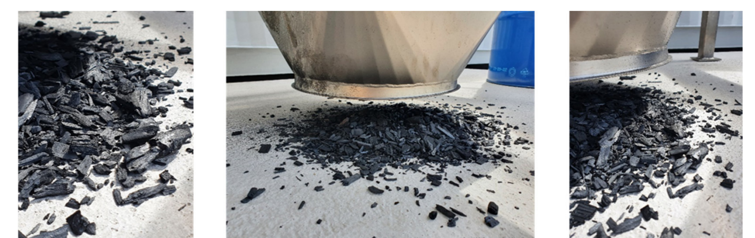
Fig. 4: Biochar produced in preliminary tests